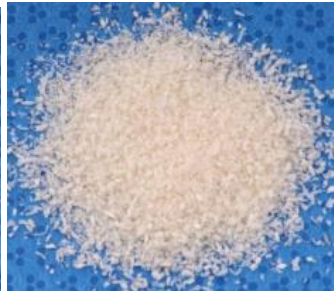
DBM with cancellous chips <0.7 mm

Fractures with no voids Small breeds Arthrodeses Hip Implants