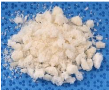
DBM with cancellous chips <4.0 mm

Large fracture voids Large mal- or non-unions Large bone loss cases