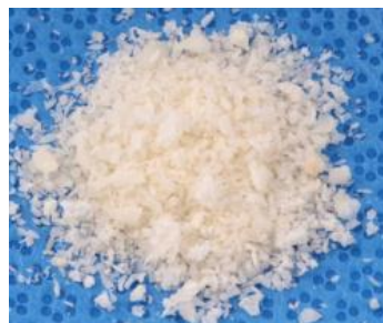
DBM with cancellous chips <2.3 mm

Fracture voids Mal- or non-unions Bone loss cases TPLOs and TTAs