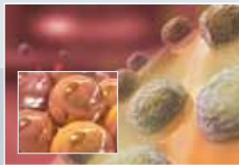
In the Arthrex IRAP II System, monocytes bind to the beads stimulating the regenerative and anti-inflammatory proteins during incubation.