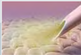
Introduction of IRAP II serum into the joint.